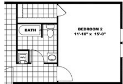
OPTION 2 BEDROOM

Our home building facilities invest in continuous product and process improvements. Plans, dimensions, features, materials, specifications and availability are subject to change without notice or obligation. Renderings and floor plans are representative likenesses of our homes and may differ from the actual homes. We invite you to tour a Home Center near you and inspect the highest value in quality housing available or call (205) 339-5397 to speak with a Home Consultant. Copyright 2017, CMH. All rights reserved.